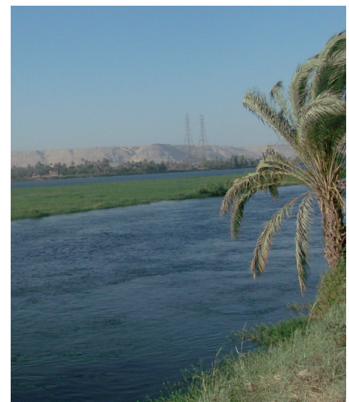
Water scarcity and island appear inside the Nile river pathway.